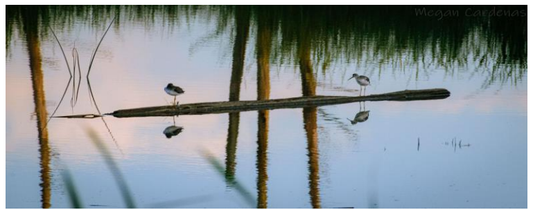
Greater Yellow Legs Wiley Slough